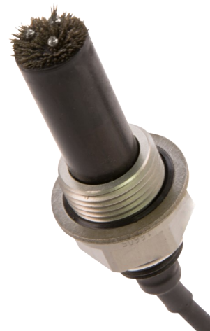
Sensor with debris attached