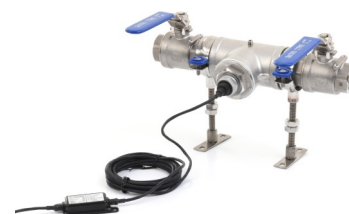
Optional In-flow adaptor