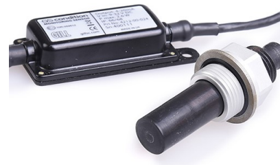
Sensor & electronics